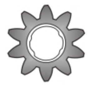
Figure 3. Sintered-Iron Impeller